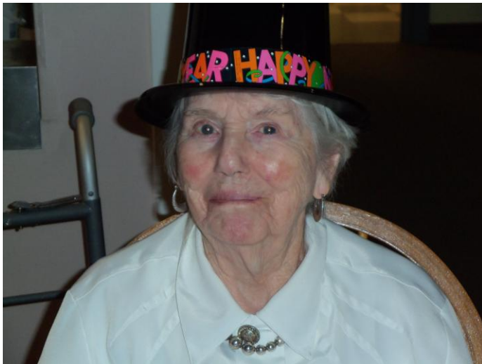
Residents ring in the New Year at annual New Year's Eve Party

Our mission is to provide a caring, homelike, affordable residence for seniors, in a setting that encourages independence, activities and involvement with families, friends, and the larger