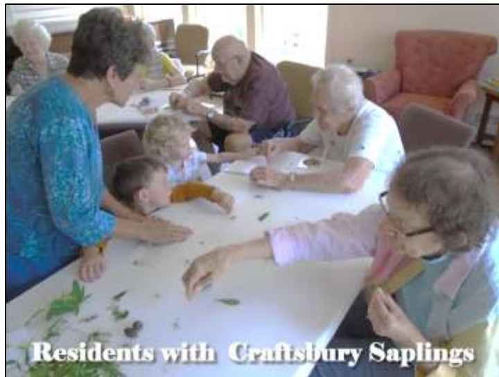
Residents with Craftsbury Saplings