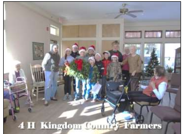
4 H Kingdom Country Farmers