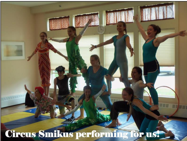
Circus Smikus performing for us!