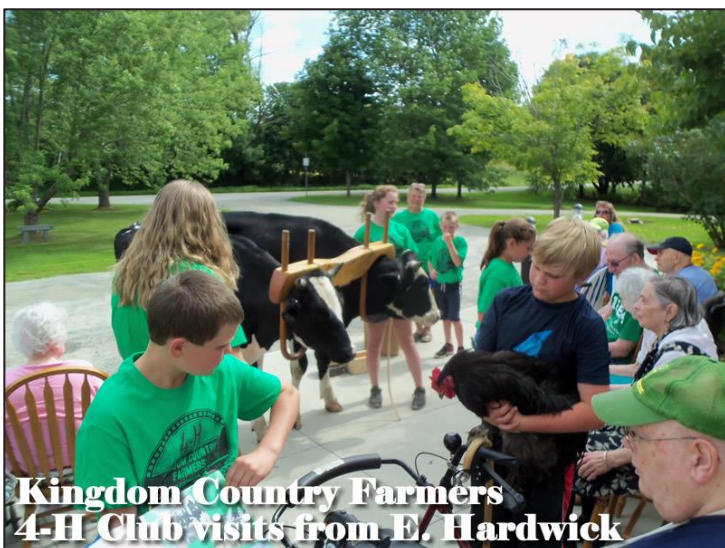
Kingdom Country Farmers 4-H Club visits from E. Hardwick