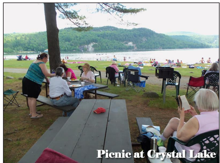
Picnic at Crystal Lake