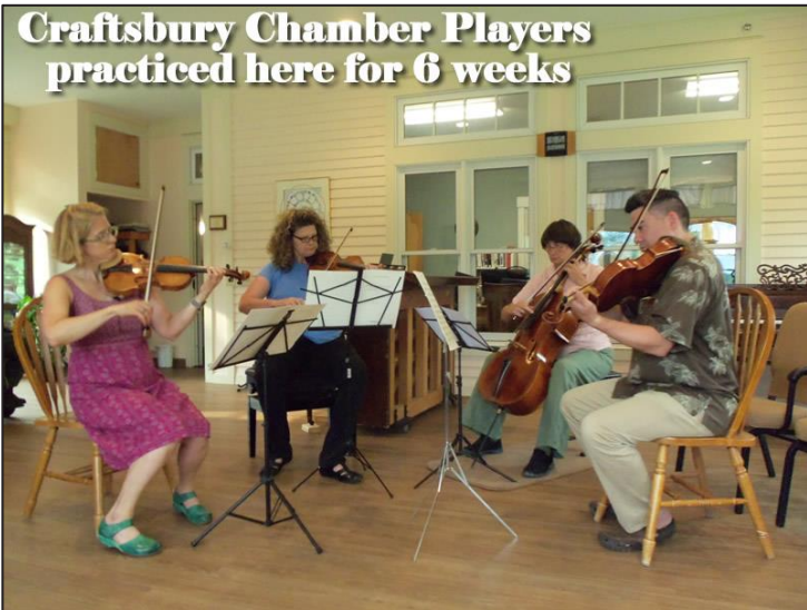
Craftsbury Chamber Players practiced here for 6 weeks