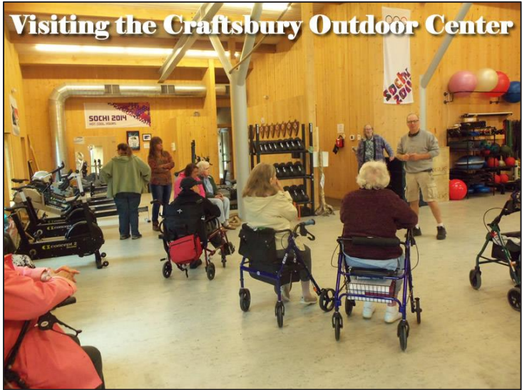
Visiting the Craftsbury Outdoor Center