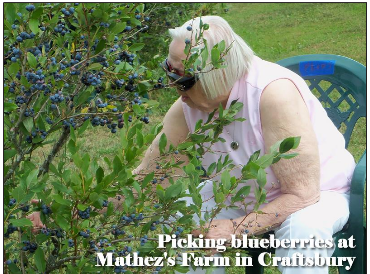
Picking blueberries at Mathez's Farm in Craftsbury