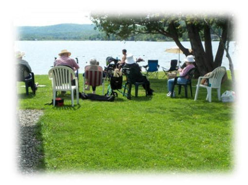
A picnic at Lake Elmore in August