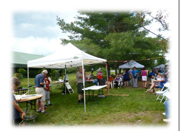
CCCC 2014 Auction