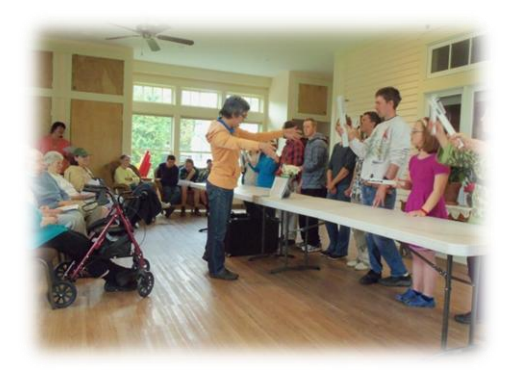
Friends from Heartbeet Farm Lifesharing perform with Chimes for us.