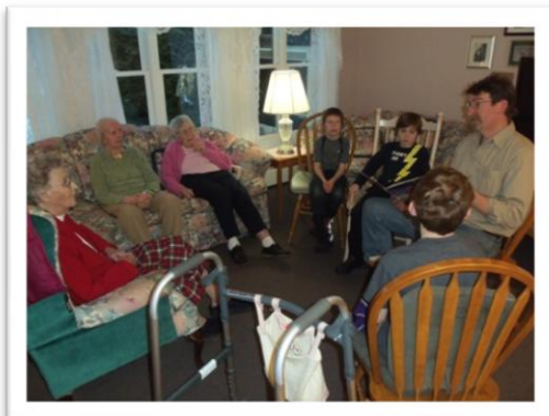
Children from Wonder and Wisdom afterschool program share stories and conversation with CCCC seniors.